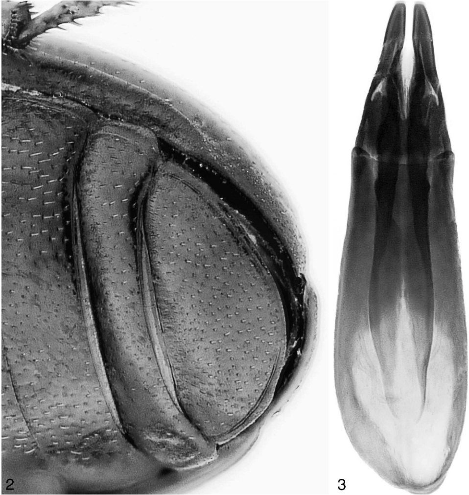
Figure 2. Opatroides punctulatus , abdominal and elytral apex, oblique ventral view, showing epipleuron ending abruptly before apex.